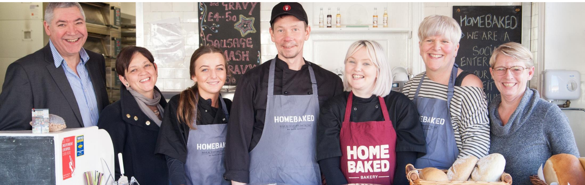
Home Baked Community Business supported by Initial Grants Programme